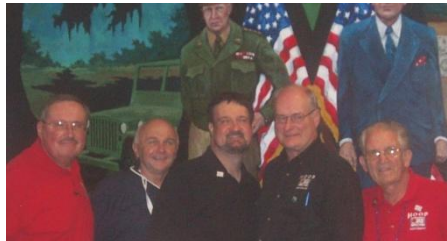
Under the Eisenhower painting at the World War II museum, members of the Hoop Historians Executive Board pose for a photo.