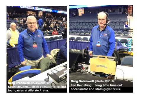
ABOVE: That final game saw social media recognize the contributions of two Hoop Historians and their years of service