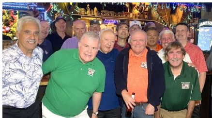
Over 20 Hoop Historians and Friends of the Hoop Historians attended the event.